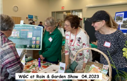
WGC at Rain & Garden Show 04.2023