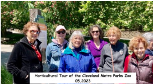
Horticultural Tour of the Cleveland Metro Parks Zoo 05.2023