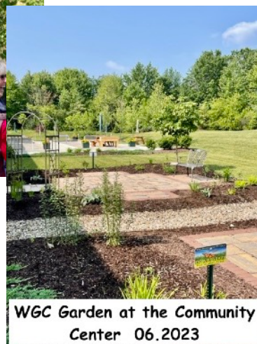
WGC Garden at the Community Center 06.2023