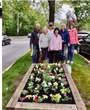
Hilliard Rd. Flower Box 05.2023