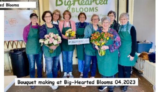
Bouquet making at Big-Hearted Blooms 04.2023