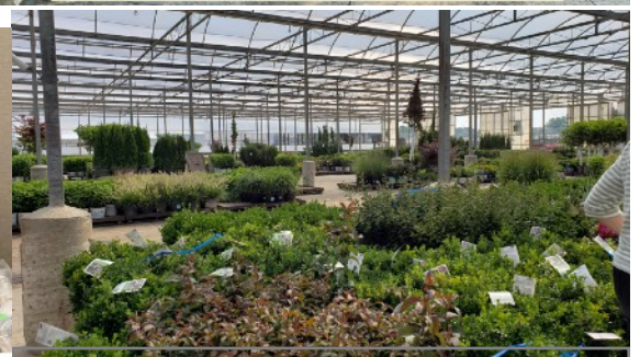
Willowy Nursery Tour 08.2023