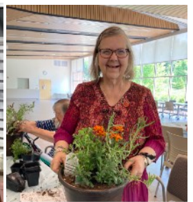
Herb Pot Planting with the Seniors at the Community Center 06.2023