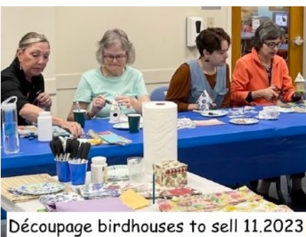
Découpage birdhouses to sell 11.2023