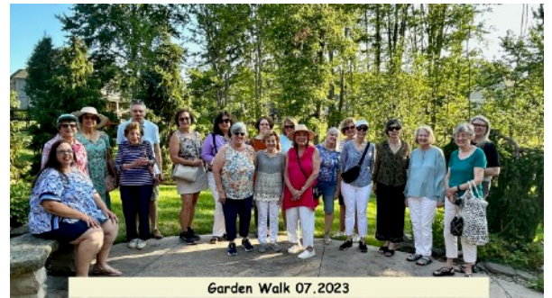
Garden Walk 07.2023