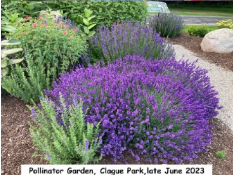
Pollinator Garden, Clague Park, late June 2023