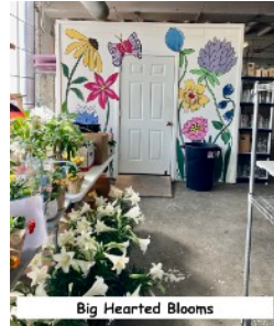
Big Hearted Blooms