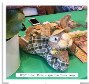
Please stop by to enjoy the exhibits. Flyer, p.4