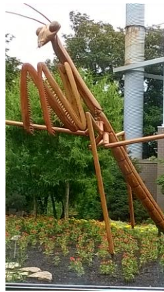
Left to right: Fountain in the Palm House; Chihuly glass exhibit in the butterfly exhibit; a praying mantis which is part of the Big Bug exhibit.