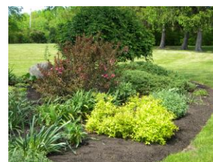
Above: East end of Remembrance Garden