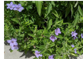
Wild Hairy Petunia