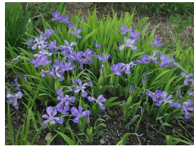
Dwarf Crested Iris